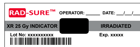
Rad-Sure™ XR irradiation indicators before and after irradiation.